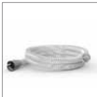
AirMini Tubing 38822