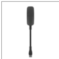
AirMini 20 W AC Adapter 38831