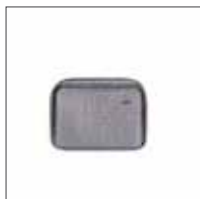
AirMini Travel Bag 38840