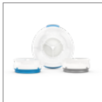
HumidX F20 38012 (3 pk) HumidX F20 38013 (6 pk)