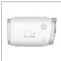
AirMini (device only) 38140