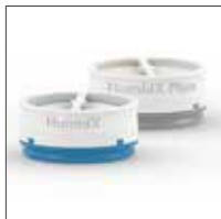
HumidX 38809 (3 pk) HumidX 38810 (6 pk) HumidX Plus 38812 (3 pk) HumidX Plus 38813 (6 pk)