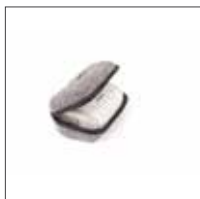
AirMini Travel Case 38841

For a complete list of AirMini accessories, and AirMini Bedside, Freedom and Travel Starter Kits, please refer to the AirMini Product and Accessories Fact Sheet.